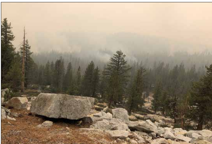
One of several managed fires burning in Yosemite