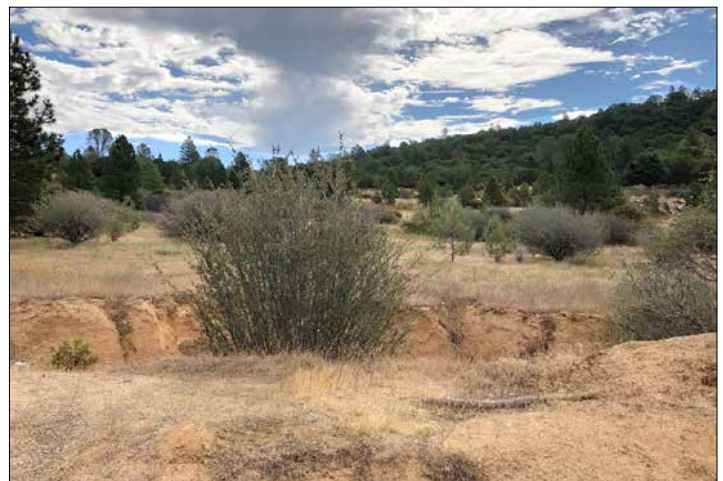
“Scar” site near Big Oak Flat is served by both public water and sewer.